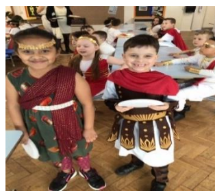
Year 3 Greek Day