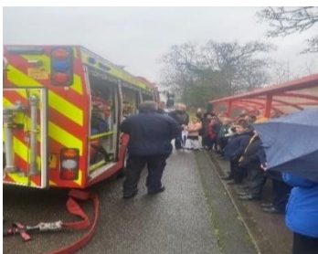
Year 5 Fire Brigade visit