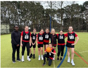
The Netball team

Our sports teams have participated in many matches and tournaments this term and have been wonderful ambassadors for the school and fantastic role models for others. Highlights included the football team beating The Pines 3-2, the netball team putting in a wonderful performance against Kings Academy Oakwood (winning 4-1) and the badminton team putting on a cracking display at their tournament, finishing 5 th out of 16 – superb effort!