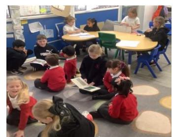
World Book Day