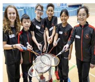
The Badminton team